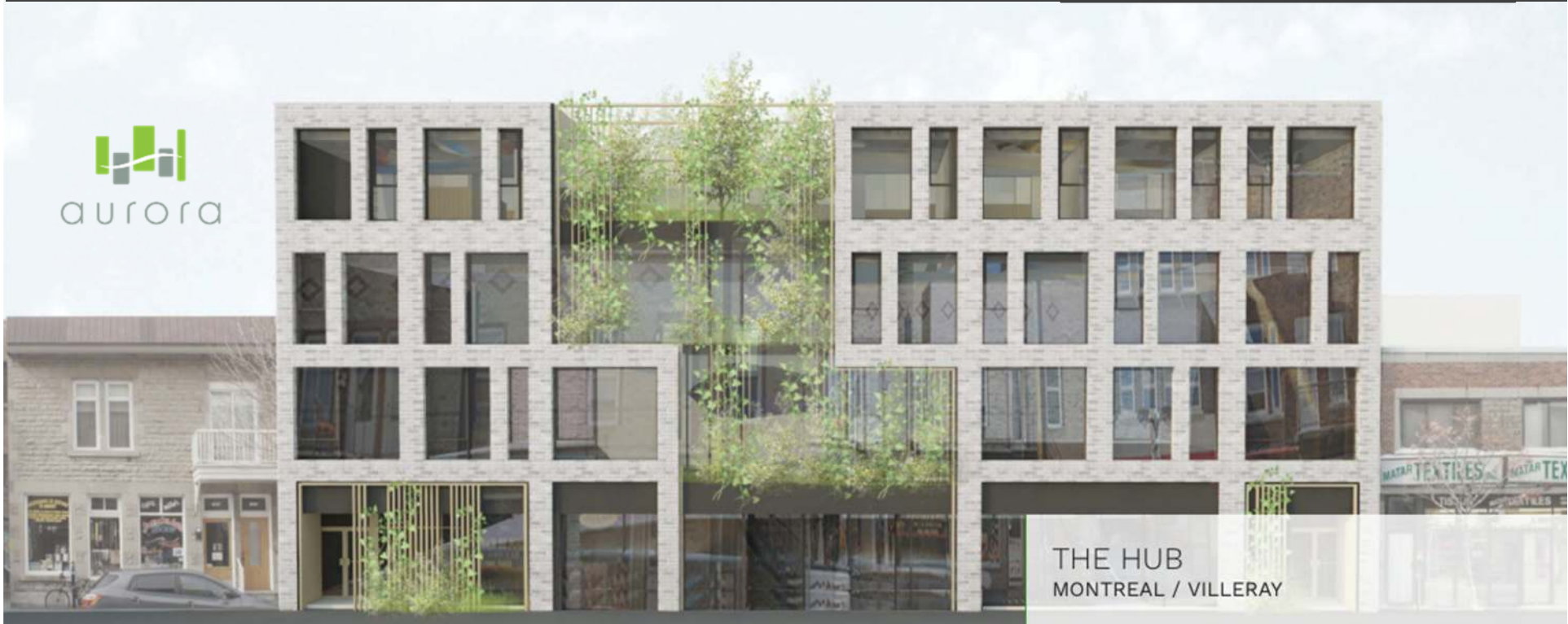
THE HUB MONTREAL / VILLERAY